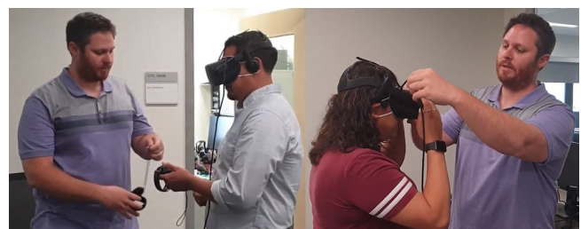
Fig. 2. University faculty training high school educators

The series of weekly meetings also addressed classroom management techniques and curriculum alternatives for students who may have issues using the technologies due to disabilities, as all students should have a role in the AR/VR programming course. Similar to other curriculum and learning standards, accommodations can be made based on the students’ 504 plans and/or Individualized Educational Plans (IEPs). This may include research-based best practices, instructional strategies, in-class support, special equipment or modifications, and/or student pairing. In some cases, space and location of the class may need to be considered. Workstation physical layout and equipment use cases were discussed for various disabilities and contingency plans were developed. Just as diversity demands universal design, students with disabilities involved in the design and programming of virtual environments can provide unique perspectives and considerations to applications of AR/VR. In turn, with their participation, AR/VR applications can expand to service those with disabilities.